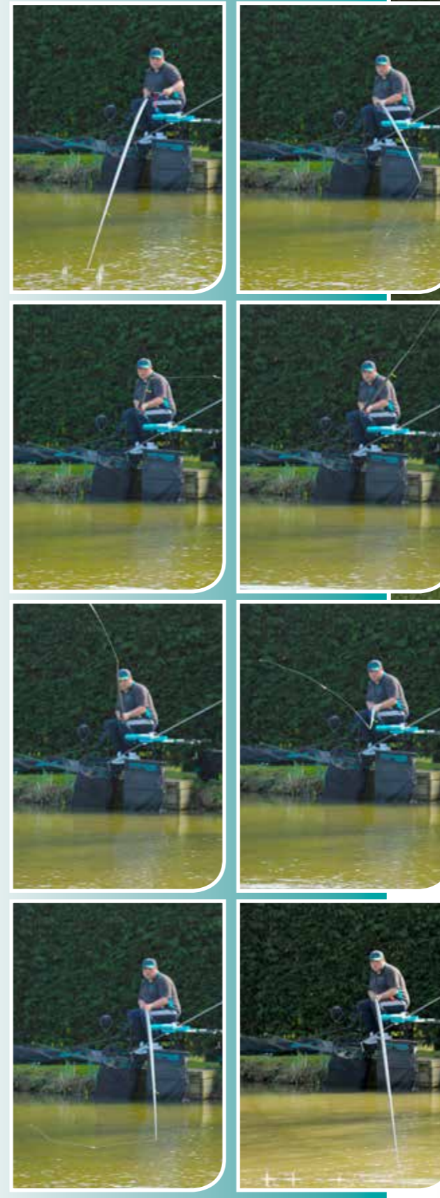
SLAP 3: THE FLOAT

VENUE FILE: SHEARSBY VALLEY LAKES LOCATION: SADDINGTON RD, SHEARSBY, LUTTERWORTH, LE17 6PX, ENGLAND WEBSITE: SHEARSBYVALLEYLAKES.CO.UK