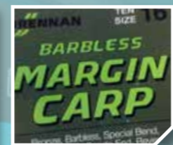
Margin Carp – the ultimate bagging hook.